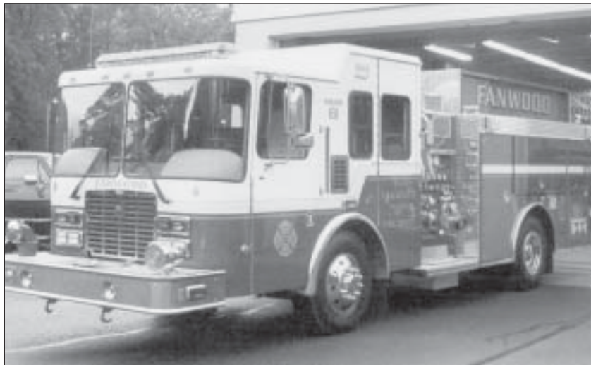
Number 8 is to be officially dedicated during Fanny Wood Day on September 24. Please see story on Page 4.