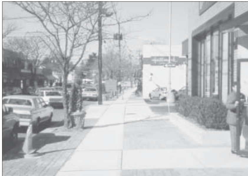
A view of Martine Avenue showing the newly installed sidewalks and pavers. Note the safety cone in the lower left of the picture denoting the future location of a new "bishop's-crook" Fanwood lamp.

Visitors to downtown Fanwood can see that the contractor has all but completed the installation of new concrete sidewalks and the pavers to match the Fanwood Clock pavers and "The Fanwood" street lamp foundations. The project extends from LaGrange Avenue to South Avenue along Martine Avenue as well as to portions of South Avenue between First and Second Streets. All the old sidewalks have been removed and new concrete sidewalks have been poured. The pavers have been skillfully cut and fitted to fill gaps between the storefronts and the curbing. Reinforced concrete driveways have been placed where macadam and cracked concrete were once in evidence. The functional and aesthetic improvements are drawing very positive comments and are presenting a minimum of inconvenience to merchants and customers during the installation. "The Fanwood" lamps are now being fabricated, and with any luck will be operation late in spring or early summer.