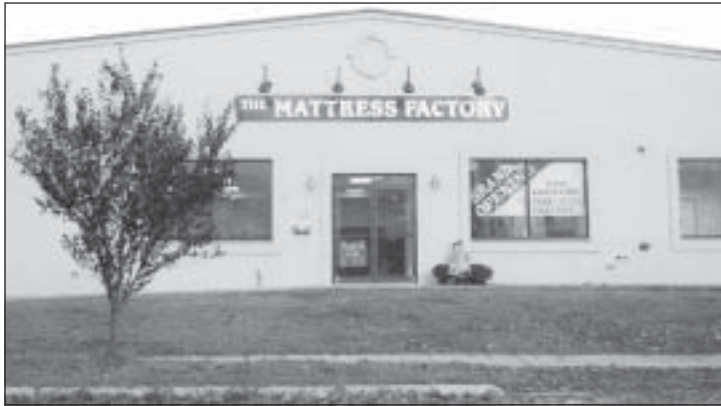
THE MATTRESS FACTORY is Fanwood's latest business addition. Located on South Avenue their new location serves as a factory and showroom. Stop in soon when looking for a new mattress.