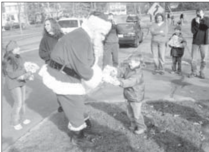
SANTA CLAUS IS COMING TO TOWN with the help of Fanwood's Emergency Services, on Saturday, December 17th for his annual pre-Christmas visit to the Borough.

The license fee is $6.00/cat and $7.00/dog for those animals neutered/spayed and $9.00/cat and $10.00/dog for those un-neutered. A late fee of $2.00 per month will be assessed on all licenses issued after January 31st.