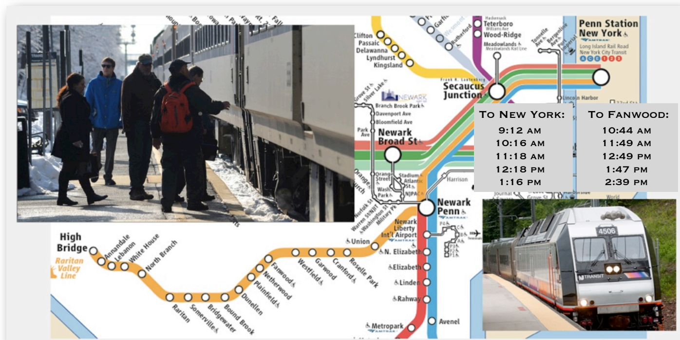
Customers board an NJT train in Fanwood, upper left; a new dual-power locomotive, lower right.