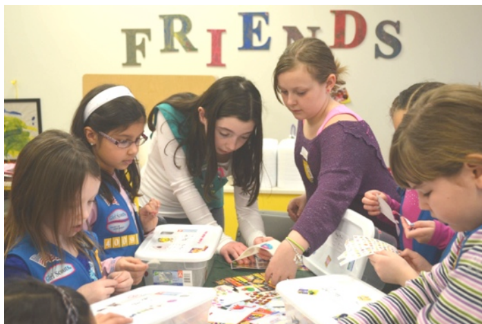
Scouts assemble packages for hospitalized children