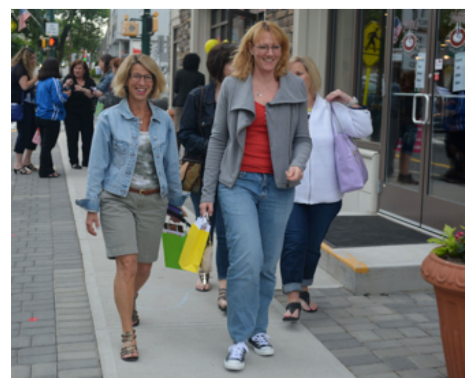
Shoppers at the 2014 Ladies' Night Out.

Check out fanwoodbusiness.com for more information.