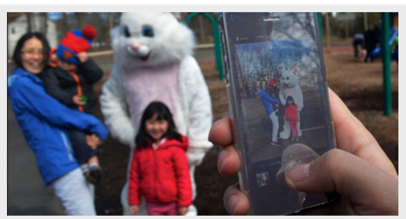
There was a little chill in the air but bright, sunny skies welcomed a good crowd to Fanwood's Forest Road Park Saturday, March 28, for the annual Easter Egg Hunt. Children 10 and under got a chance to meet the Easter Bunny and to hunt for more than 1,000 eggs, filled with all sorts of goodies including hundreds of prize tickets, that were hidden around the park. Prizes were also given out for guessing the number of jelly beans and the number of chocolate eggs; a bunny drawing contest and an egg decorating contest. The annual event was organized by Fanwood's Recreation Commission.