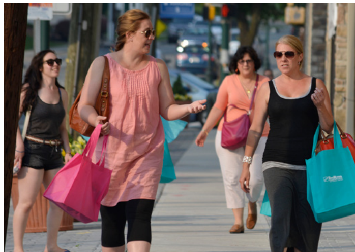
Ladies Night Out shoppers on South Avenue in 2015.

Shopper alert! Circle June 2 on your calendar for Fanwood's 5th Annual Ladies Night Out. The event will take place from 6-9 p.m that night in downtown Fanwood.