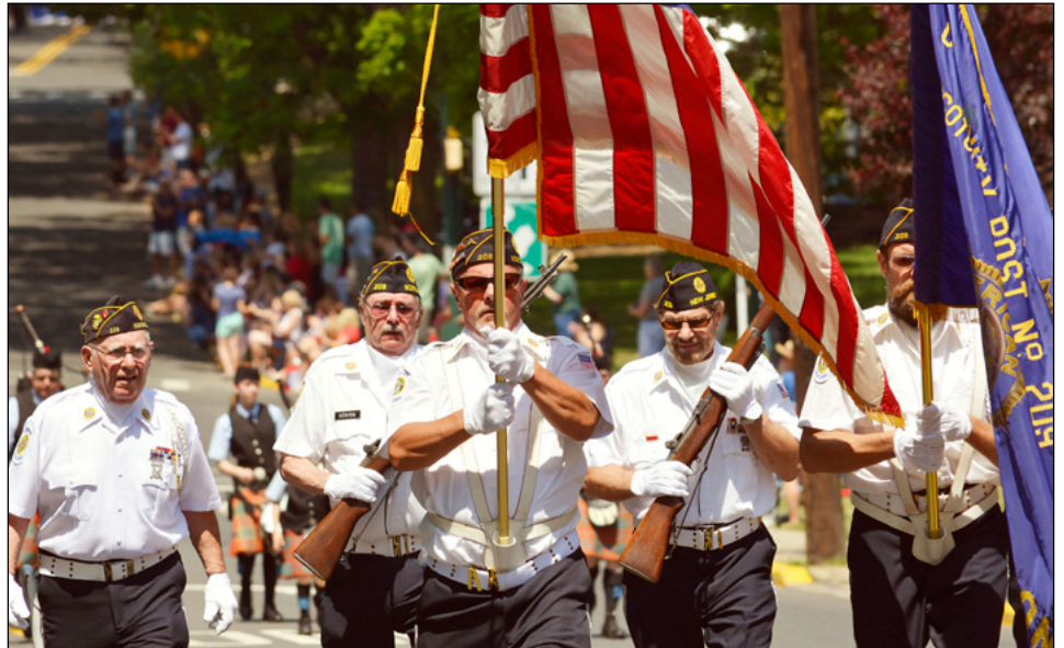
Last year's Memorial Day parade marches through downtown Fanwood