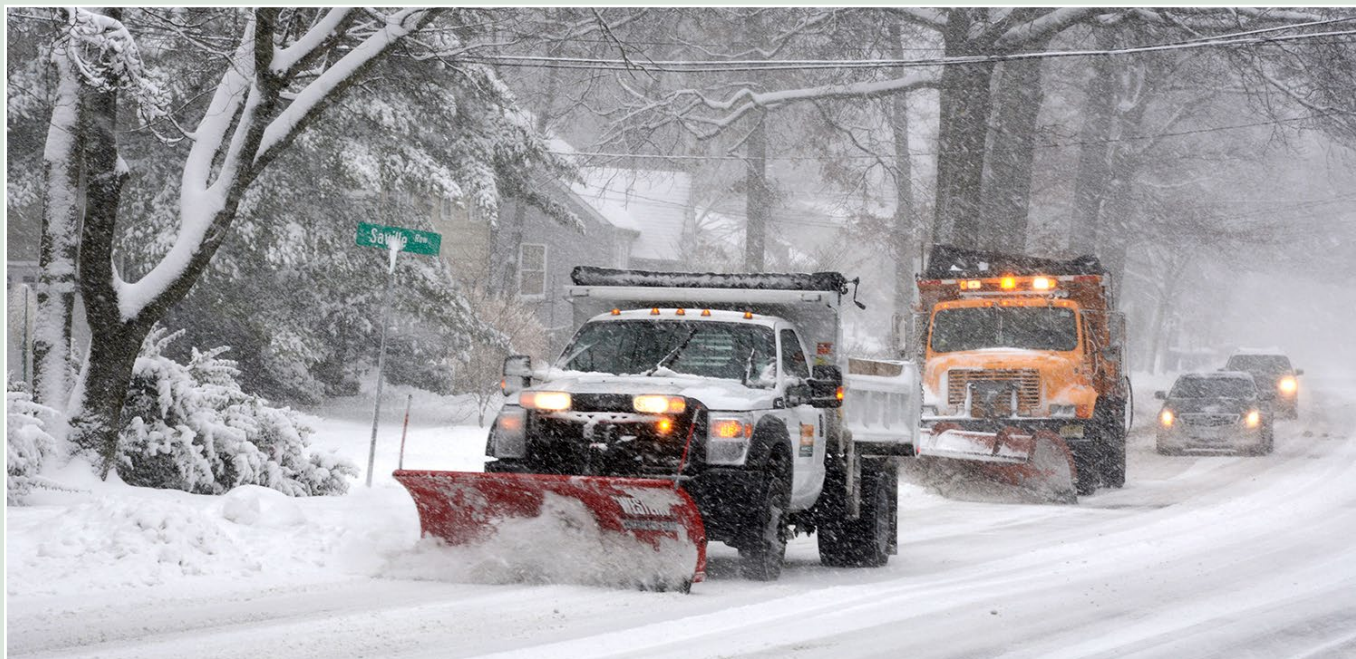
On the morning of Thursday, February 9 Union County plows work to clear South Martine Avenue during a winter storm event.