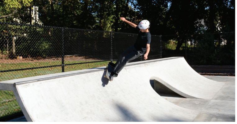
ABOVE The Fanwood Recreation Commission opened the Fanwood Skatepark in June, located in Forest Road Park, providing a safe location for our many residents who enjoy skateboarding and bmx biking.