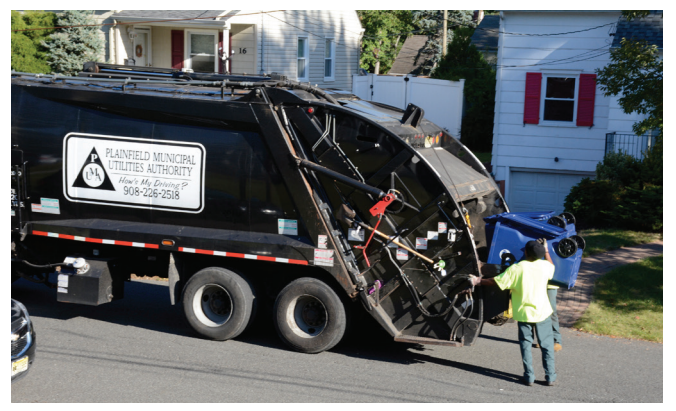
ABOVE Fanwood's first curbside recycling program began on Thursday, October 6.

LEFT The Fanwood Recreation Commission invites residents to get their rackets and try out the recently reopened, newly resurfaced La Grande Park tennis courts. In addition to getting a new paint job, the courts have been leveled and drainage around them has been improved to reduce water collecting on the surface.