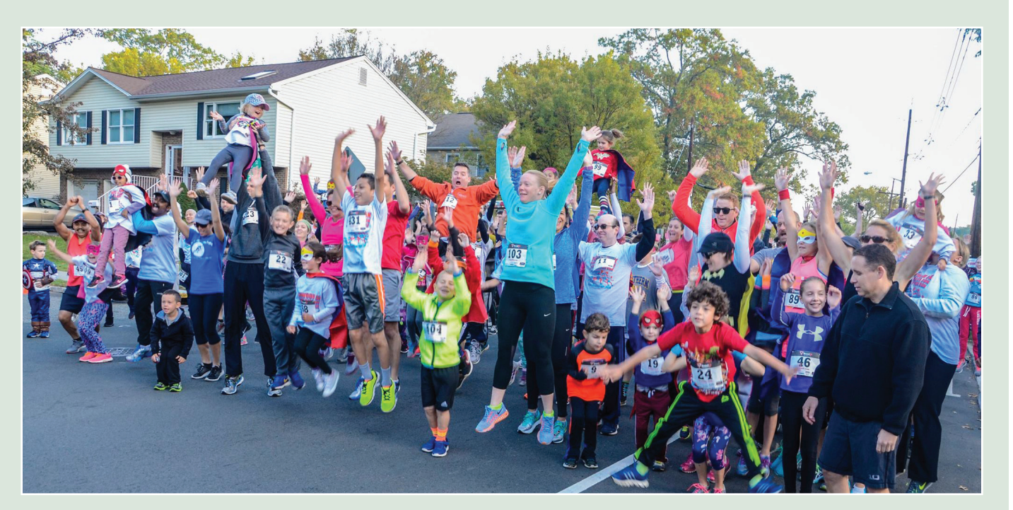
Fanwood runners line up for the start of the Fanwood 5k Super Hero Run on October 16. Registration fees from the race benefit Fanwood Recreation events, projects, and programs.