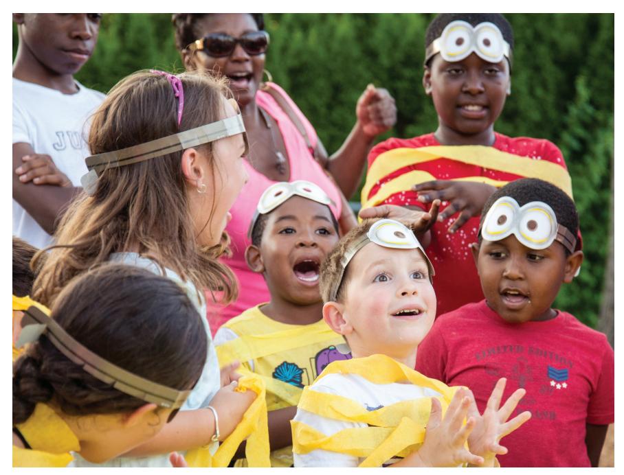
ABOVE Children enjoyed Fanwood Recreation Commission's Party in the Park with games, rides, and of course, The Minions movie.