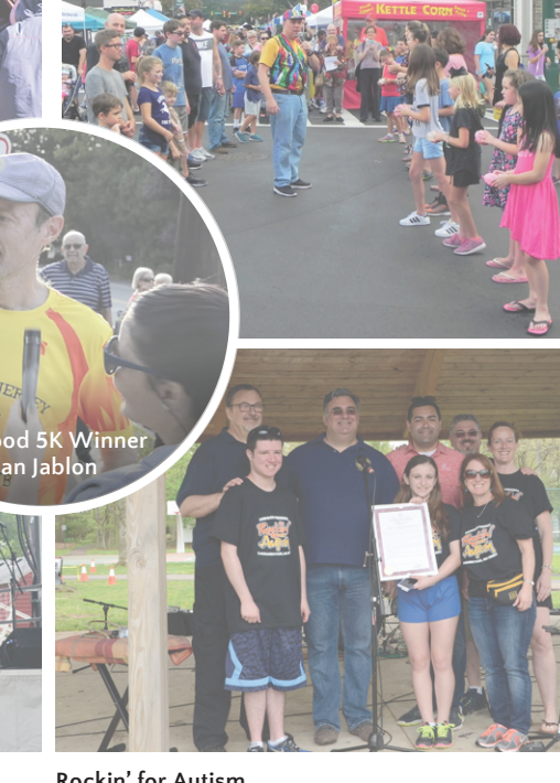
Rockin' for Autism