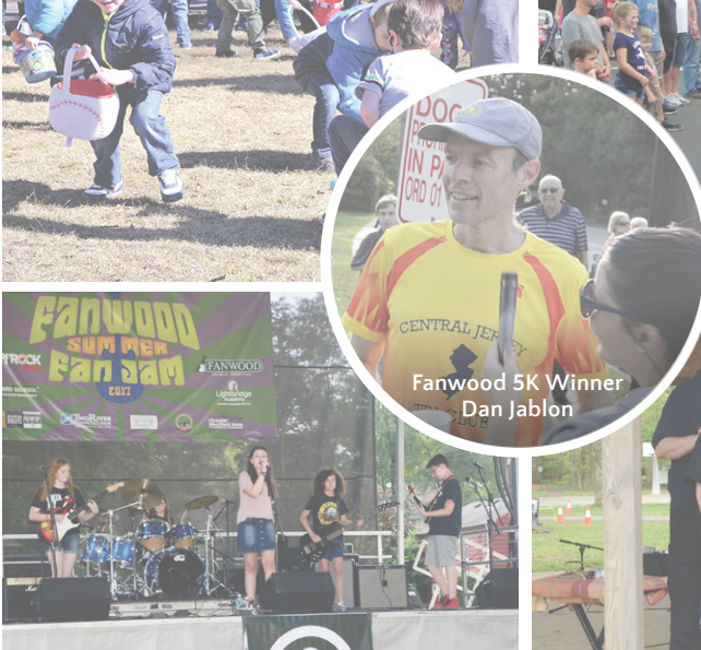
Fanwood Summer Fan Jam