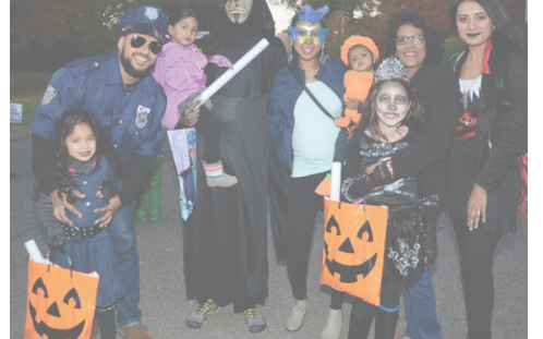
Annual Fanwood Halloween Parade