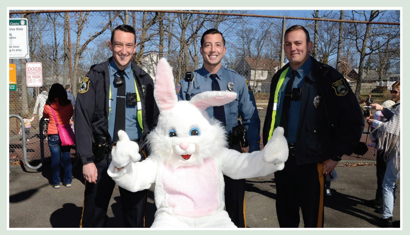
Some of Fanwood's finest with the Easter Bunny at the annual Easter Egg Hunt at Forest Road Park