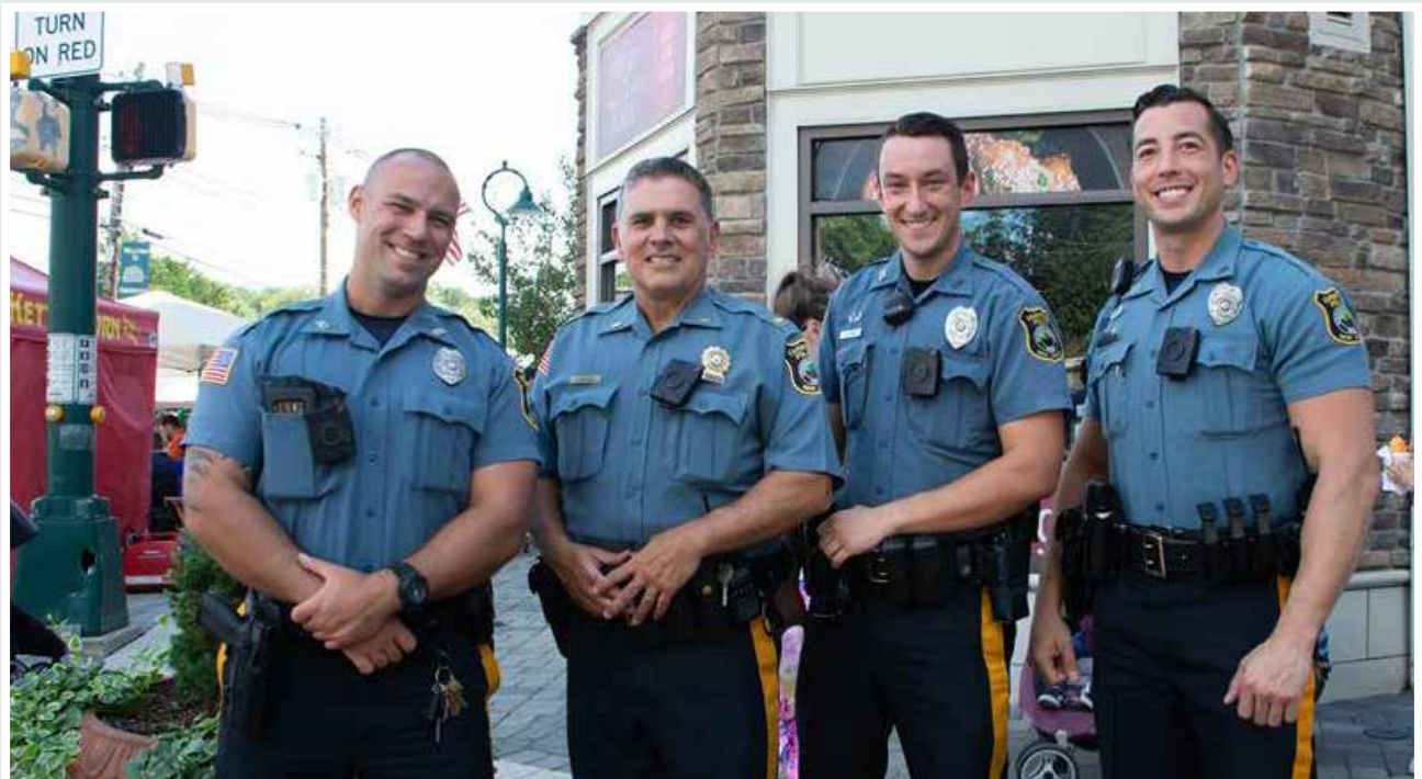
Fanwood's Finest Keeping Our Streets Safe for Fanny Wood Day Fun!